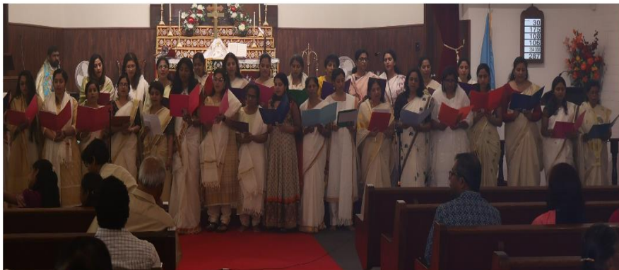
Sunday School Teachers Dedication